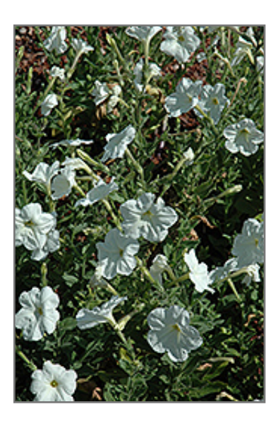
Large White Petunia flowers

An original ancestor of modern petunias, from which hybrids are developed; releases a lovely vanilla-licorice scent at night; a large mounded growth habit