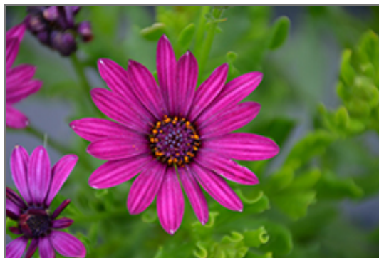
Sunny Mary African Daisy flowers