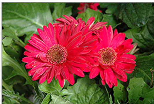
Royal Deep Rose Gerbera Daisy flowers