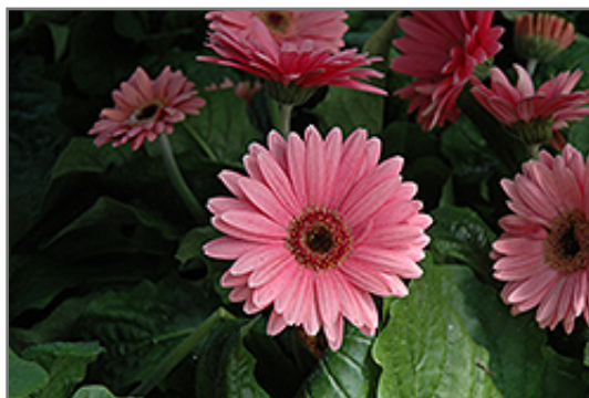
Royal Deep Pink Gerbera Daisy flowers