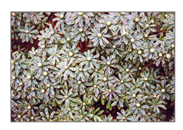
Variegated Rose Daphne foliage

A stunning garden accent shrub with intoxicatingly fragrant pink flowers held over creamy white-edged foliage in spring; a fussy plant, needing light shade and well-drained soil; never move once established