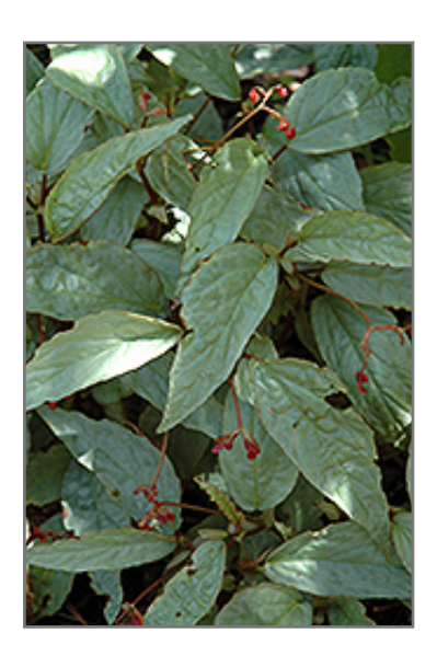
Silver Begonia foliage

A striking begonia with stunning silver leaves for a visual impact in the garden; white blooms with hints of shell pink are produced primarily through winter; grows well in humid conditions; a bright addition to a shaded area