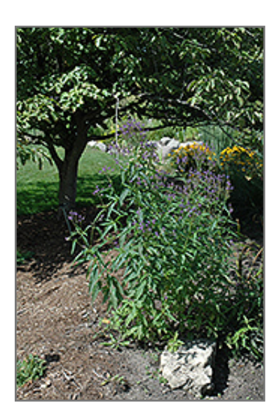
Blue Verbena in bloom