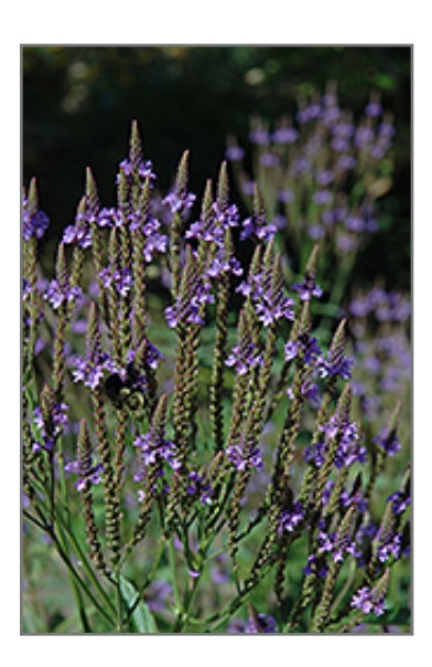
Blue Verbena flowers

Blue Verbena is recommended for the following landscape applications;