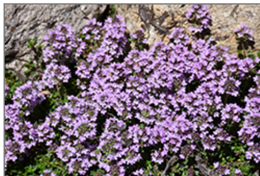
Purple Carpet Creeping Thyme flowers