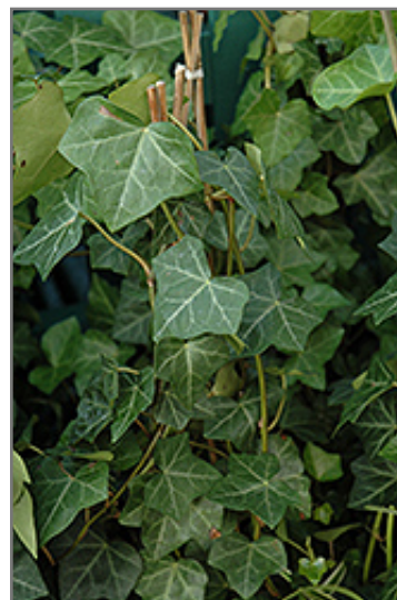
Thorndale Ivy foliage