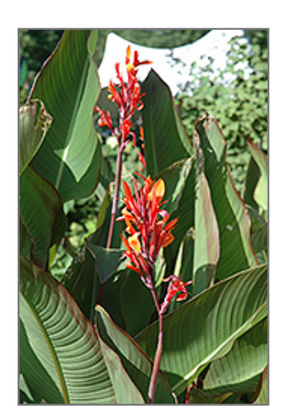
Achira Canna flowers

This plant is native to the tropics and prefers growing in moist environments with evenly warm conditions all year round. In our climate, it is usually grown as an outdoor annual in the garden or in a container. If you want it to survive the winter, it can be brought in to the house and provided with special care, and then returned to the garden the following season. In its preferred tropical habitat, it can grow to be around 8 feet tall at maturity, with a spread of 3 feet. However, when grown as an annual or when overwintered indoors, it can be expected to perform differently, and its exact height and spread will depend on many factors; you may wish to consult with our experts as to how it might perform in your specific application and growing conditions.