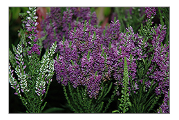
Purple Explosion Speedwell flowers