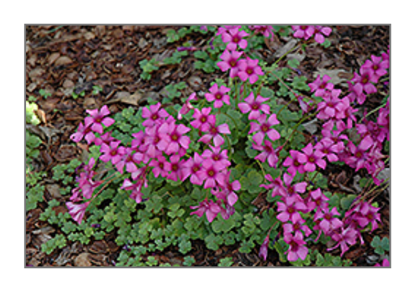
Wood Sorrel flowers

Rich clover-like bright green foliage, covered with dainty deep-pink trumpets with dark centers in spring; will light up the shaded areas of the garden; heavy spring bloom is followed by sporadic re-bloom all summer; morning sun to bright shade is fine