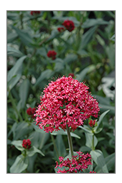
Red Valerian flowers