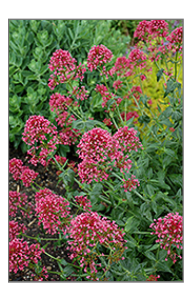
Red Valerian flowers

Red Valerian is recommended for the following landscape applications;