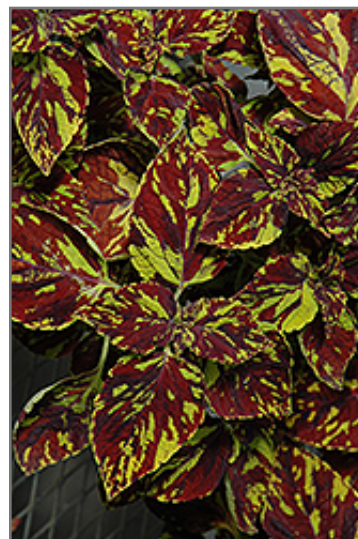
Splish Splash Coleus foliage

Splish Splash Coleus will grow to be about 30 inches tall at maturity, with a spread of 24 inches. When grown in masses or used as a bedding plant, individual plants should be spaced approximately 20 inches apart. Although it's not a true annual, this fast-growing plant can be expected to behave as an annual in our climate if left outdoors over the winter, usually needing replacement the following year. As such, gardeners should take into consideration that it will perform differently than it would in its native habitat.