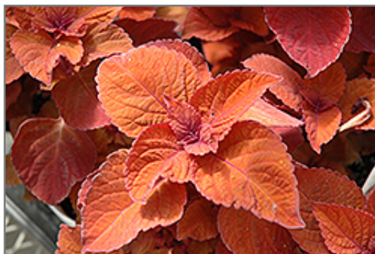
ColorBlaze Keystone Kopper Coleus foliage