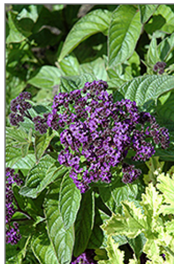
Marine Heliotrope flowers

Beautifully scented, deep purple flower clusters are featured on upright mounded dark green foliage; a heat tolerant variety, excellent in borders, patio containers and hanging baskets; deadhead to encourage new growth throughout the season