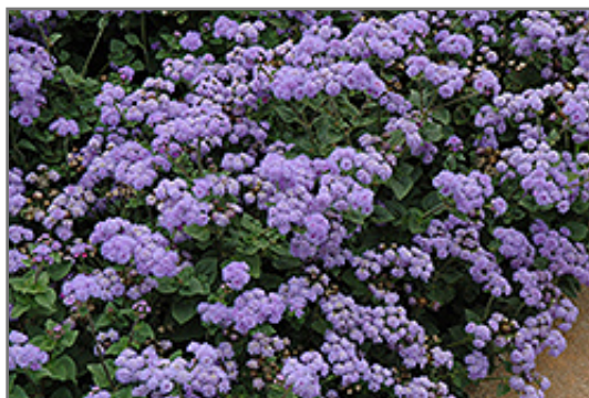
High Tide Blue Flossflower in bloom

High Tide Blue Flossflower is a fine choice for the garden, but it is also a good selection for planting in outdoor containers and hanging baskets. It is often used as a 'filler' in the 'spiller-thriller-filler' container combination, providing a mass of flowers against which the thriller plants stand out. Note that when growing plants in outdoor containers and baskets, they may require more frequent waterings than they would in the yard or garden.