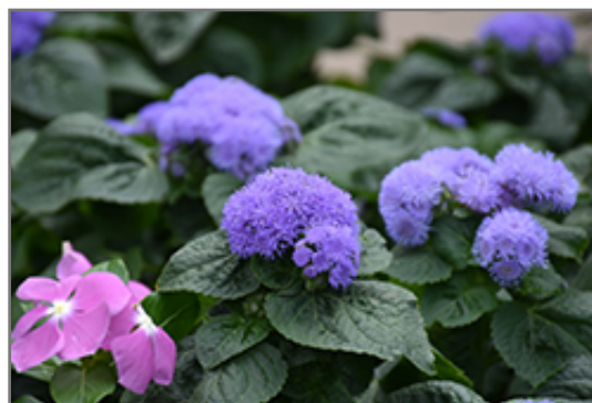
High Tide Blue Flossflower flowers