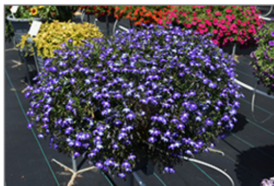
Magadi Compact Blue Plus Eye Lobelia in bloom