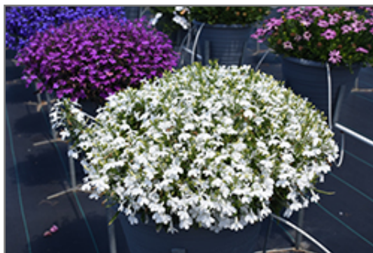
Techno Upright White Lobelia in bloom

Techno Upright White Lobelia is a fine choice for the garden, but it is also a good selection for planting in hanging baskets. Because of its trailing habit of growth, it is ideally suited for use as a 'spiller' in the 'spiller-thriller-filler' container combination; plant it near the edges where it can spill gracefully over the pot. Note that when growing plants in outdoor containers and baskets, they may require more frequent waterings than they would in the yard or garden.