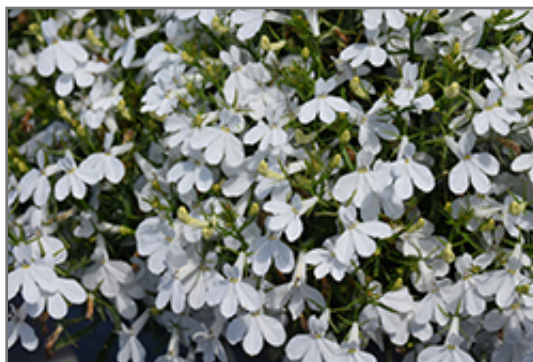
Techno Upright White Lobelia flowers

Techno Upright White Lobelia is recommended for the following landscape applications;