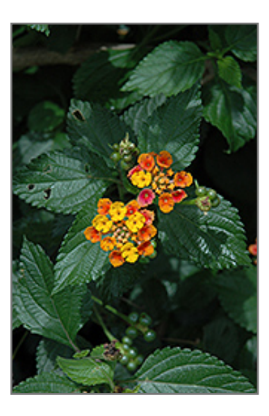
Ham And Eggs Lantana flowers