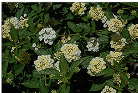
Denholm White Lantana flowers