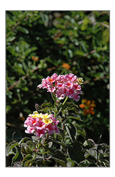
Mozelle Lantana flowers