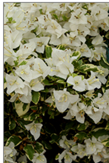
White Stripe Bougainvillea flowers