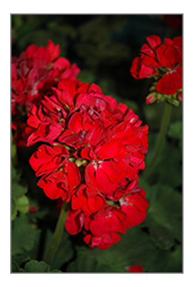
So Amazing! Neon Geranium flowers