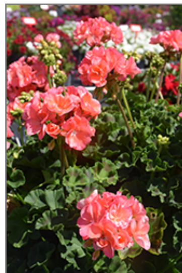
Dynamo Salmon Geranium flowers