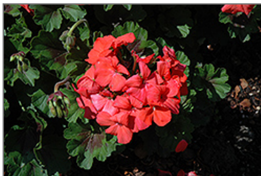
Pillar Flame Geranium flowers