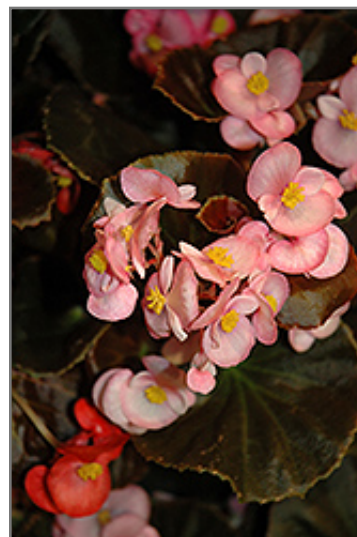
Nightife Pink Begonia flowers

This is a high maintenance plant that will require regular care and upkeep, and usually looks its best without pruning, although it will tolerate pruning. Deer don't particularly care for this plant and will usually leave it alone in favor of tastier treats. Gardeners should be aware of the following characteristic(s) that may warrant special consideration;