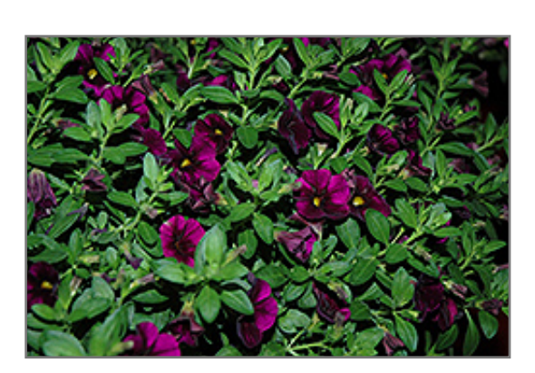
Aloha Kona Midnight Purple Calibrachoa flowers

Aloha Kona Midnight Purple Calibrachoa is recommended for the following landscape applications;