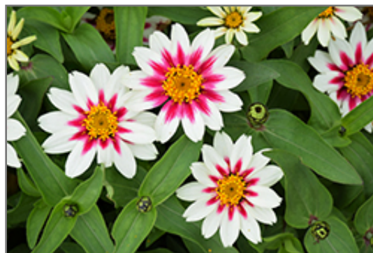
Zahara Starlight Rose Zinnia flowers

Zahara Starlight Rose Zinnia is recommended for the following landscape applications;