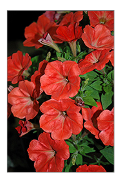
Good And Plenty Orange Petunia flowers

Good And Plenty Orange Petunia will grow to be about 10 inches tall at maturity, with a spread of 14 inches. When grown in masses or used as a bedding plant, individual plants should be spaced approximately 10 inches apart. Its foliage tends to remain low and dense right to the ground. This fast-growing annual will normally live for one full growing season, needing replacement the following year.