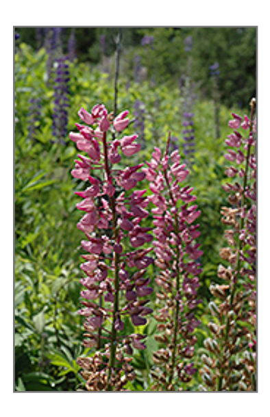
Rose Lupine flowers

A valued native variety producing spikes of lovely rose-pink flowers; a tremendous visual impact massed in the garden, border plantings or in containers