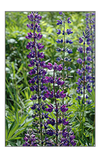
Purple Lupine flowers

A valued native variety producing spikes of stunning purple blooms; a tremendous visual impact massed in the garden, border plantings or in containers