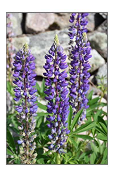
Blue Lupine flowers

A valued native variety producing spikes of eye catching flowers of blue-violet; a tremendous visual impact massed in the garden, border plantings or in containers