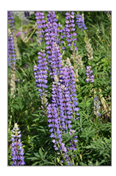
Wild Lupine flowers

A valued native variety producing spikes of eye catching flowers of blue-violet; a tremendous visual impact massed in the garden, border plantings or in containers