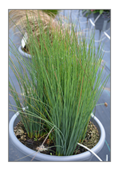
Blue Dart Rush