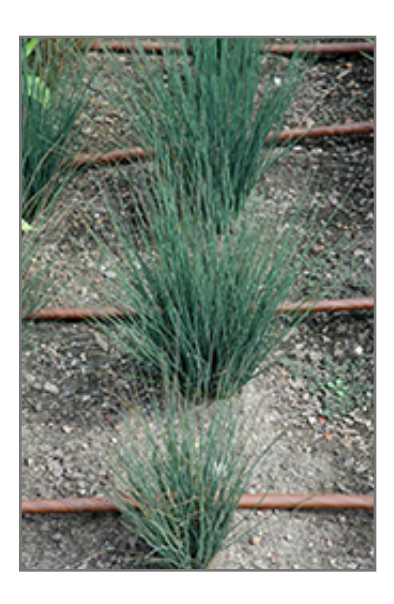
Blue Dart Rush