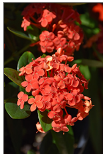
Maui Ixora flowers

Maui Ixora will grow to be about 3 feet tall at maturity, with a spread of 3 feet. Although it's not a true annual, this slow-growing plant can be expected to behave as an annual in our climate if left outdoors over the winter, usually needing replacement the following year. As such, gardeners should take into consideration that it will perform differently than it would in its native habitat.