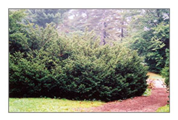
Densa Japanese Yew

A very dense and wide-spreading evergreen shrub with beautiful deep green needles which emerge bright green; excellent for foundation plantings or shrub borders, takes pruning extremely well; one of the few evergreens that loves shade