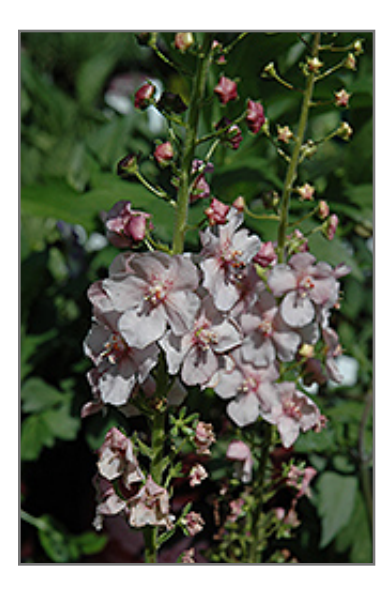
Jackie Mullein flowers

A compact variety with short, well branched spikes of pale salmon-yellow blooms with fuzzy plum rose stamens, rising from a tight rosette of fuzzy green leaves; the smaller size makes it perfect for containers; deadheading encourages new blooms