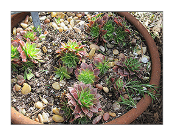
Hens And Chicks