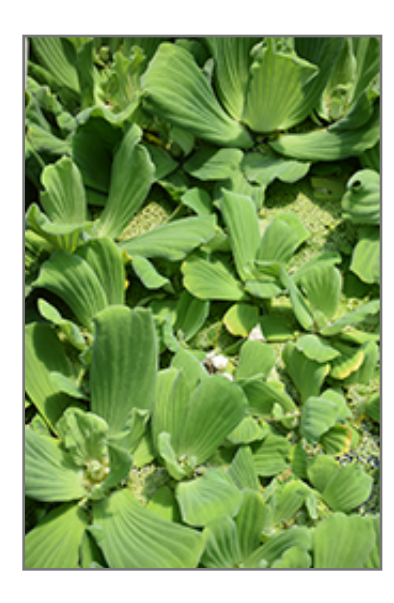
Water Lettuce foliage

This plant will require occasional maintenance and upkeep, and is best cleaned up in early spring before it resumes active growth for the season. Gardeners should be aware of the following characteristic(s) that may warrant special consideration;