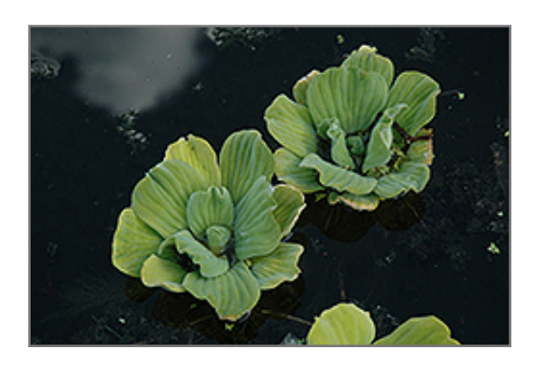
Water Lettuce foliage