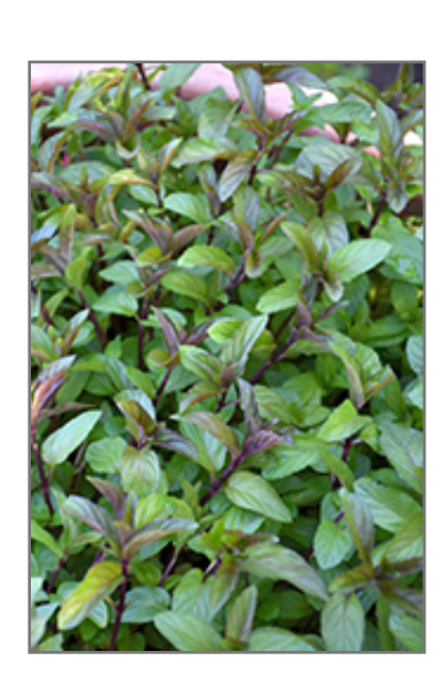
Chocolate Mint foliage

This is an herbaceous perennial herb with a spreading, ground-hugging habit of growth. Its medium texture blends into the garden, but can always be balanced by a couple of finer or coarser plants for an effective composition. This is a high maintenance plant that will require regular care and upkeep, and should be cut back in late fall in preparation for winter. It is a good choice for attracting bees and butterflies to your yard, but is not particularly attractive to deer who tend to leave it alone in favor of tastier treats. Gardeners should be aware of the following characteristic(s) that may warrant special consideration: