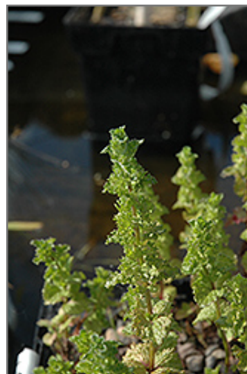
Curly Mint foliage

Aside from its primary use as an edible, Curly Mint is suitable for the following landscape applications;