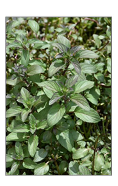
Water Mint foliage

Aside from its primary use as an edible, Water Mint is sutiable for the following landscape applications;