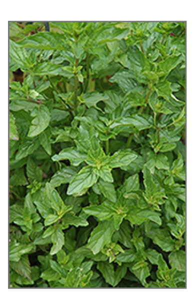
Margarita Mint foliage

Aside from its primary use as an edible, Margarita Mint is sutiable for the following landscape applications;