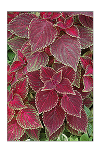
Volcano Coleus foliage

Volcano Coleus will grow to be about 20 inches tall at maturity, with a spread of 18 inches. When grown in masses or used as a bedding plant, individual plants should be spaced approximately 15 inches apart. Although it's not a true annual, this fast-growing plant can be expected to behave as an annual in our climate if left outdoors over the winter, usually needing replacement the following year. As such, gardeners should take into consideration that it will perform differently than it would in its native habitat.