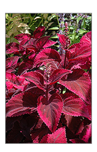
Mariposa Coleus foliage

Mariposa Coleus will grow to be about 24 inches tall at maturity, with a spread of 30 inches. When grown in masses or used as a bedding plant, individual plants should be spaced approximately 24 inches apart. Although it's not a true annual, this fast-growing plant can be expected to behave as an annual in our climate if left outdoors over the winter, usually needing replacement the following year. As such, gardeners should take into consideration that it will perform differently than it would in its native habitat.