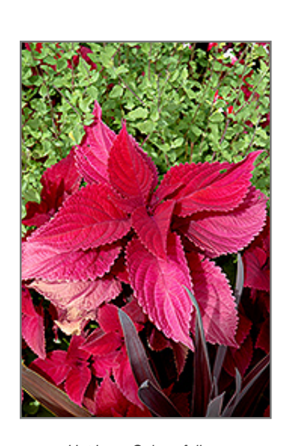
Hot Lava Coleus foliage

Hot Lava Coleus will grow to be about 18 inches tall at maturity, with a spread of 14 inches. When grown in masses or used as a bedding plant, individual plants should be spaced approximately 10 inches apart. Although it's not a true annual, this fast-growing plant can be expected to behave as an annual in our climate if left outdoors over the winter, usually needing replacement the following year. As such, gardeners should take into consideration that it will perform differently than it would in its native habitat.