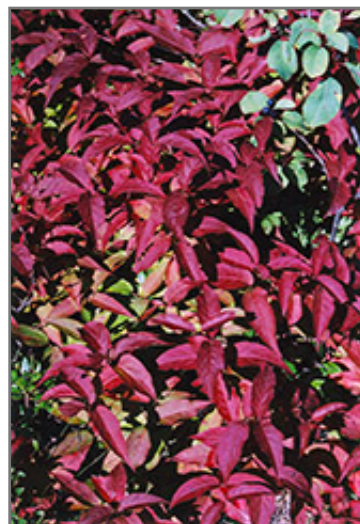
Bush Honeysuckle in fall

This shrub does best in full sun to partial shade. It is very adaptable to both dry and moist locations, and should do just fine under average home landscape conditions. It is not particular as to soil type or pH. It is highly tolerant of urban pollution and will even thrive in inner city environments. This species is native to parts of North America.