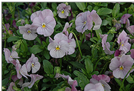
Sorbet Lilac Ice Pansy flowers

Sorbet Lilac Ice Pansy is recommended for the following landscape applications;