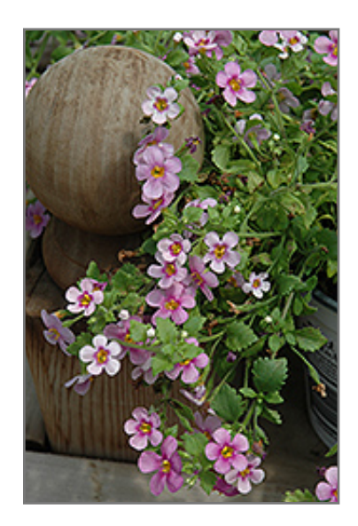
Savoir Faire Ballet Pink Bacopa flowers